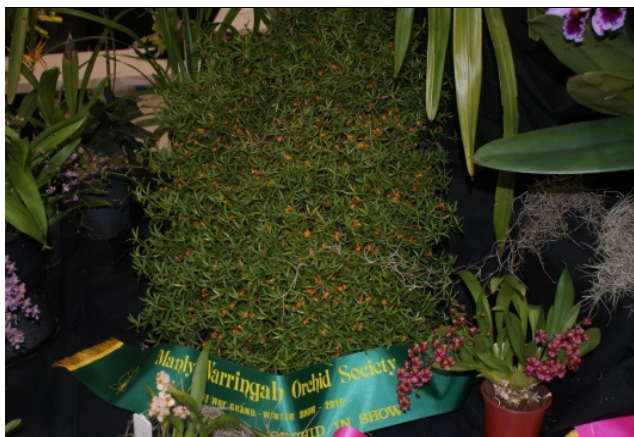
Reserve Champion Mediocalcar decoratum Grown by Tinka Riddell