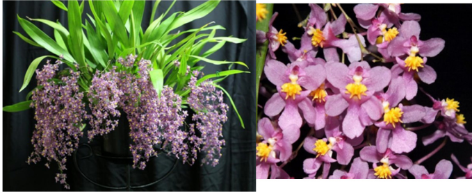
Oncidium [Onc.] sotoanum (syn ornithorhyncum)

At St Ives show there should be some for sale which is a good way to get different ones from yellows to dark reds. Below are the parents.