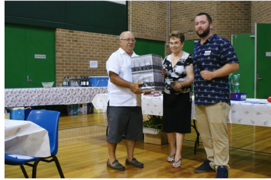
Cary – 2 nd place in point score