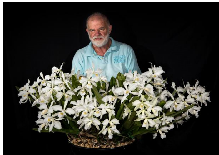
Laelia purpurata 'Louanne'

I had to show this to someone as I can't get it to a meeting and can't even get it thru the door and not sure about the care either as well as being 110cm in dia it weighs 23-25kg when wet and hard to lean over and grab it. No wonder I have a bad back☺.