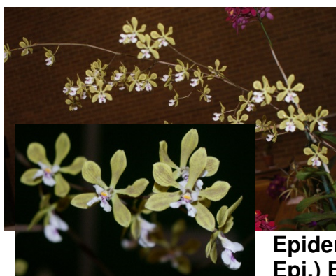
Epidendrum or Epi.) Burdekin