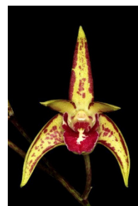
This is Den Starsheen “ Botank Fireworks”

This is a nice native Dendrobium grown by Ros, not bad in shape and looks good.