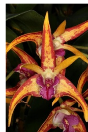
X Den. Rutherford Starburst “Rockstar”