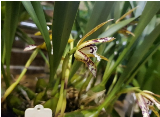
Maxillaria (Brasiliorchis) picta .