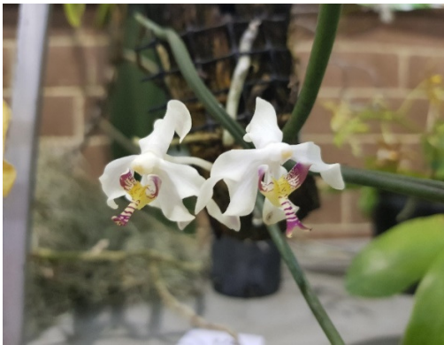
Phalaenopsis bastianii , Phalaenopsis cornu-cervi 'Red,' Phalaenopsis sumatrana & Paraphalaenopsis serpentilingua . A great selection of Phalaenopsis species was on display, with Paraphalaenopsis serpentilingua being a real standout. We don't get an opportunity to see these shown very often.